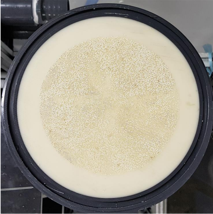
Picture) De.mem 8-inch Ultrafiltration (UF) membrane module (cross section)

De.mem's hollow fiber NF membrane technology allows for lower operating costs and reduced investment relative to other conventional water treatment technologies, at high filtration quality. It was successfully validated by De.mem (ASX release: 20 February 2018) and has received its first commercial orders for projects in Singapore and Vietnam (ASX release: 3 April 2018).