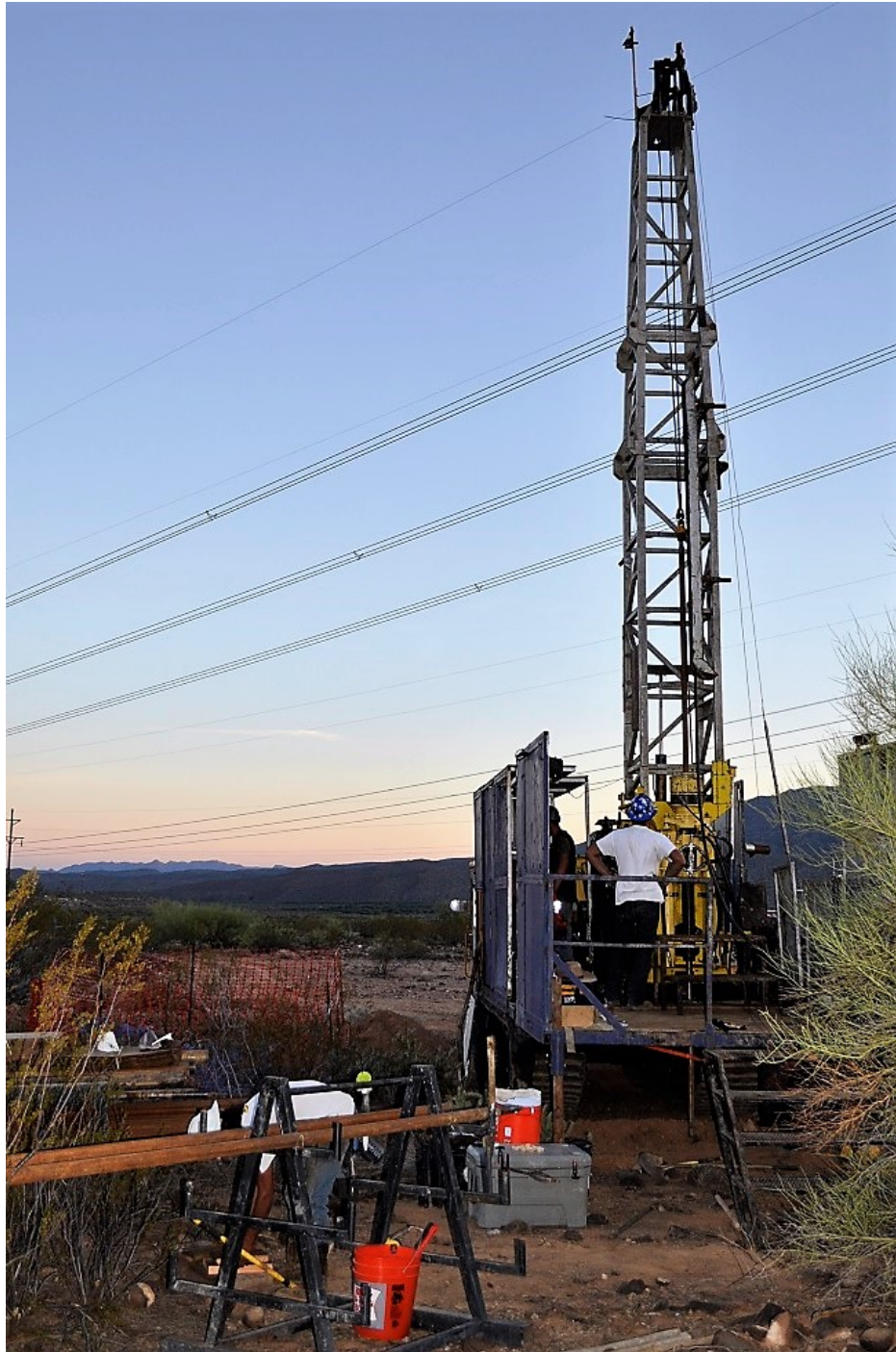
Figure 3 – Big Sandy – Maiden Drill Program Commenced