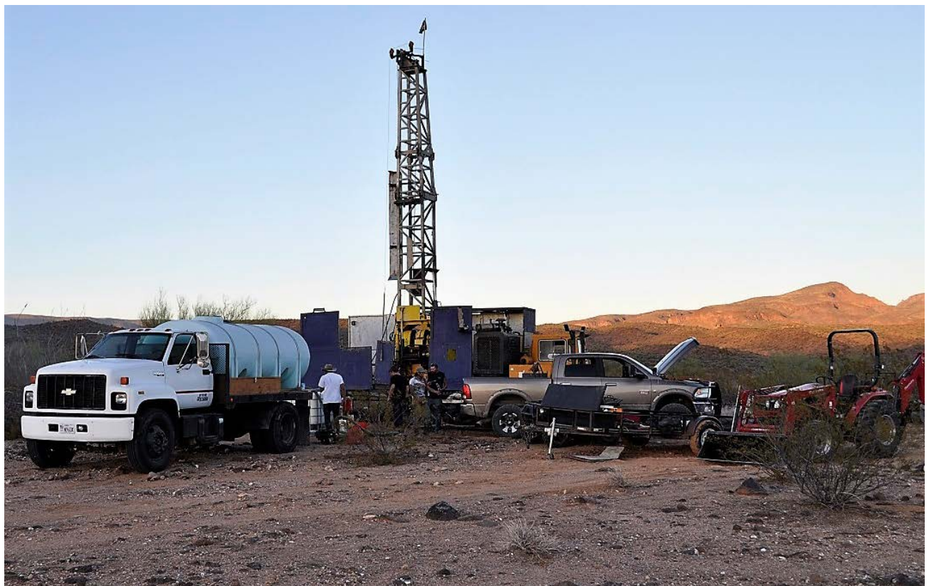
Figure 2 – Big Sandy – Maiden Drill Program Commenced