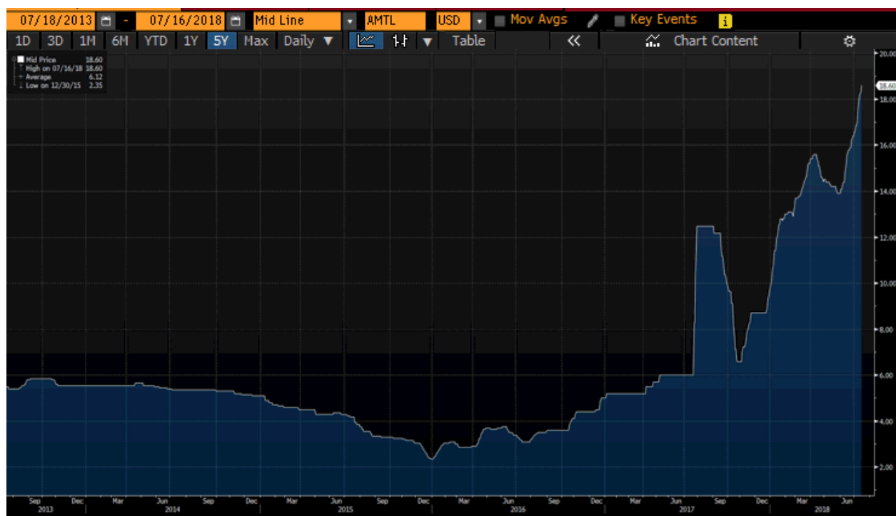
FIGURE 1: VANADIUM PENTOXIDE PRICE CHART

The Board's strategy is to create value for shareholders and select projects, opportunistically if appropriate, that deliver this outcome. Entering into the NVM transaction, at a time when disruptive forces (i.e. Vanadium Redox Batteries gaining traction) are propelling the price of vanadium higher (Figure 1) and end users are seeking new supply chains, meets this core criteria.