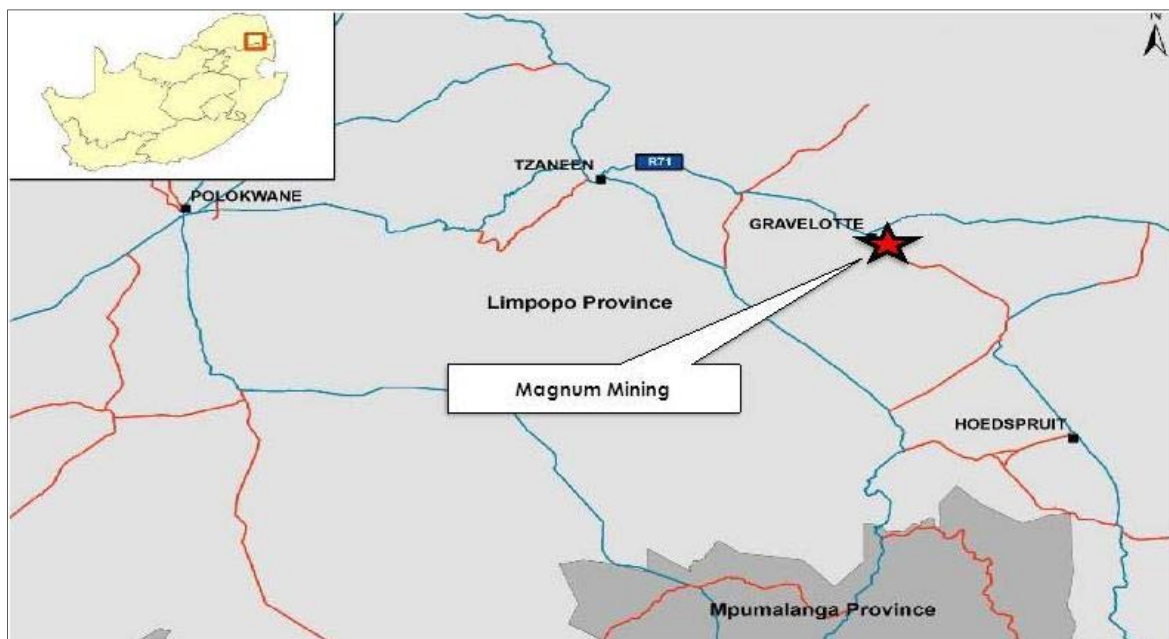
Figure 1: Gravelotte Location Map

To date, the Phase 1 of the trial mining programme has treated 256.6 tonnes of crushed dump material from four dumps and recovered 11,774.8 carats of emeralds. This is an average recovered grade of 46 carats per tonne.