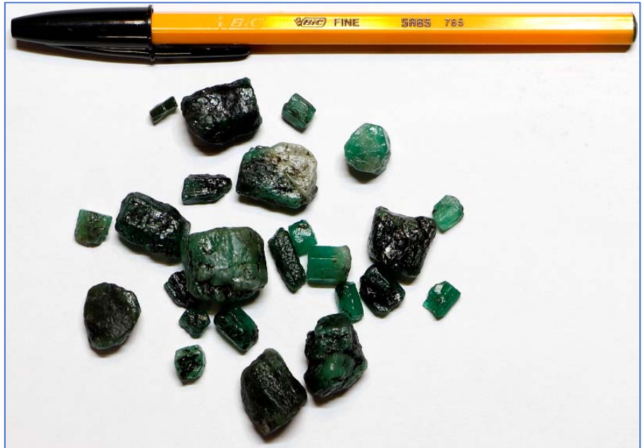
Photo 1: Partially cleaned emeralds ranging from 3.5 to 41.5 carats in weight and 5-25mm is size

Phase 1 campaign delivers over 11,700 carats of emeralds to date, with test work results to assist with proposed re-establishment of commercial mining operations