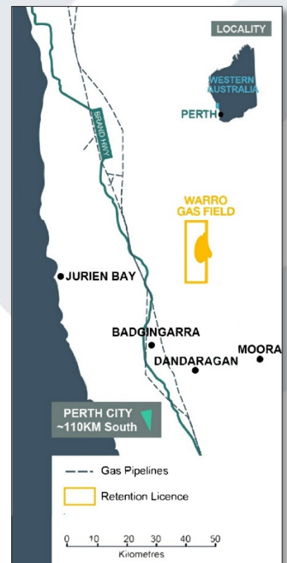
Figure 1 - Warro Location Map

“As the industry lies dormant awaiting the official findings and recommendations, the decision has been made to relinquish the permits outside of the Warro core field resources, namely EP321 and RL-6 and concentrate on RL7.”