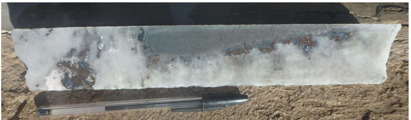
Figure 3: MO-A4-001D drill core at ~389.5m depth showing bornite and chalcocite in quartz/carbonate vein