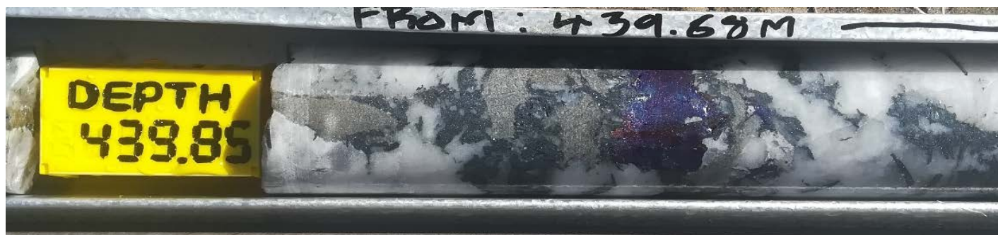
Figure 1: MO-A4-001D drill core at ~440m depth showing coarse bornite within quartz/carbonate vein

"Because the buried domes defined by EM appear to be intact and are not eroded at surface, any mineralisation that was deposited within these domes should still be there", Mr Hanna added.