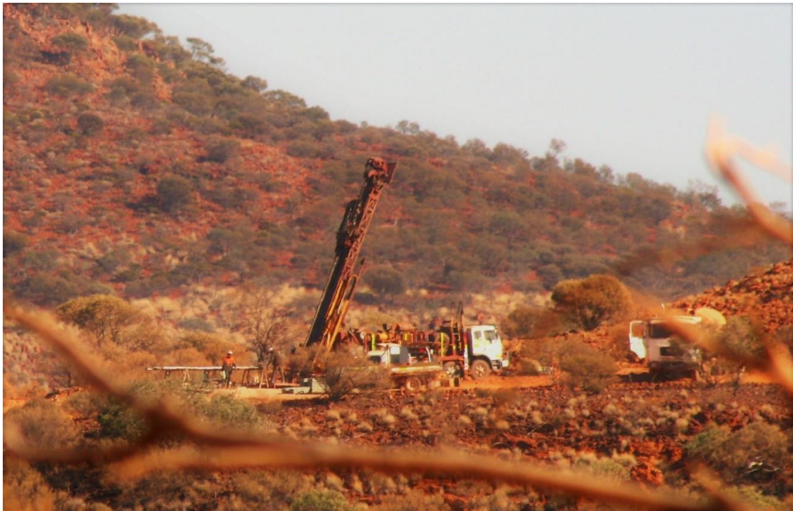
Figure 4: Diamond core drilling at Woodlands 46-40 Prospect

Galena is excited by the results of satellite drilling At Woodlands as it confirms and enhances the prospectively in the tenement package which hosts Abra. A second diamond drilling rig has been operational at Abra since early May and continues to perform infill drilling in several selected locations within the world-class Abra deposit to facilitate advanced economic studies currently underway. Abra remains the focus of the Company and the Pre-Feasibility study remains on track for deliver in September.