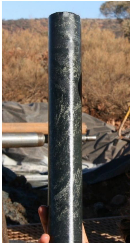
Figure 2: Chalcopyrite (copper sulphide) mineralisation in GWD002 at the 46-40 Prospect

Samples have been cut and submitted to SGS in Perth for analysis. Assays are expected for both holes in early July.