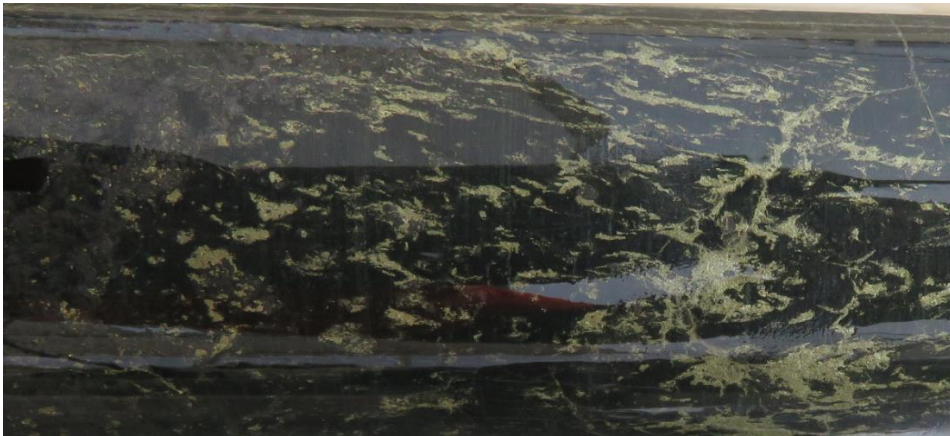
Figure 3: Close up view of significant chalcopyrite in GWD002