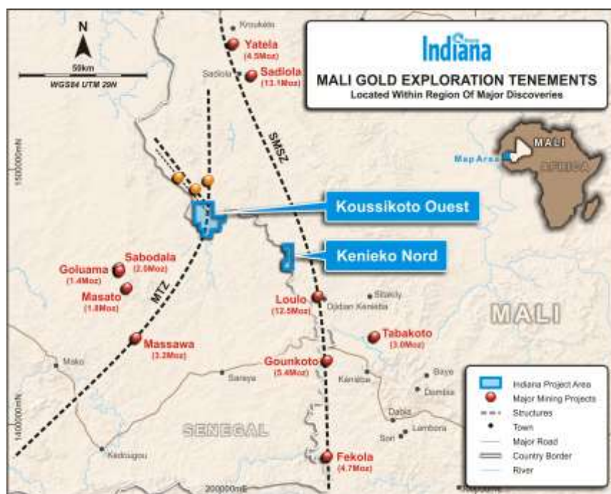
Figure 1 – Indiana project areas, west Mali

At Koussikoto, drilling comprised 150 holes for 3,967m and focused on priority geochemical and structural targets along the 10km MTZ within the central portion of the Project area (Figure 2). At Kenieko, 19 holes for 358m were drilled, targeting a recently identified artisanal gold mining trend in the north of the project area. Samples have been submitted to the laboratory, with analytical results expected at the end of June. This data will be used to plan the next phase of exploration activity, which is expected to commence following the end of the rainy season in October.