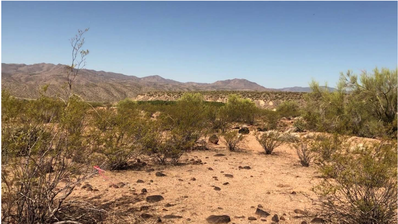
Figure 2 – Big Sandy – Hole 3 Approved Drill Location

We have engaged with local drilling contractors to finalise mobilisation logistics and expect the programme to commence in June 2018.”