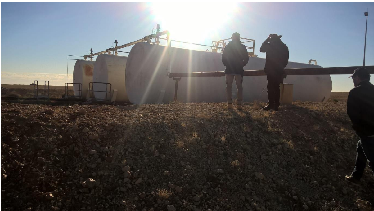
Storage tanks – Innamincka Dome Project