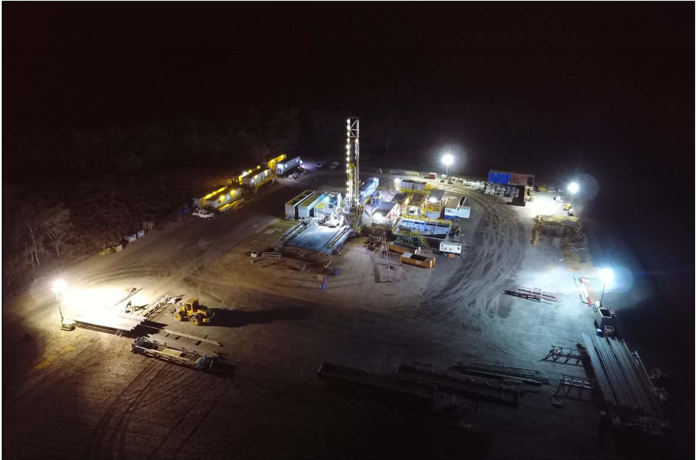
Photo 1 - Ensign drilling rig 964 on location of the Armour Energy Myall Creek 4A well.